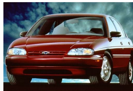
1997 Chevy Lumina

1997, 1999, 2001, 2003, 2005, 2007, 2009, 2011, 2013, 2015, 2017, 2019