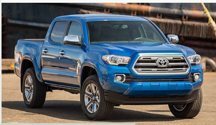
2019 Toyota Tacoma