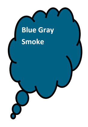
Excessive oil is being burnt